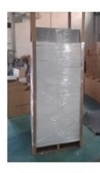
HANDMADE PALLET PACKING