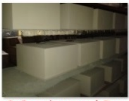
8.Coating and Dry