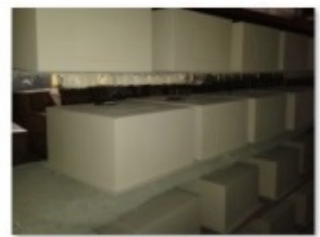
8.Coating and Dry