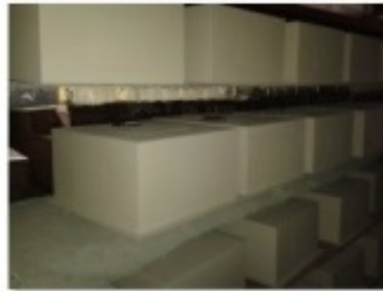
8.Coating and Dry