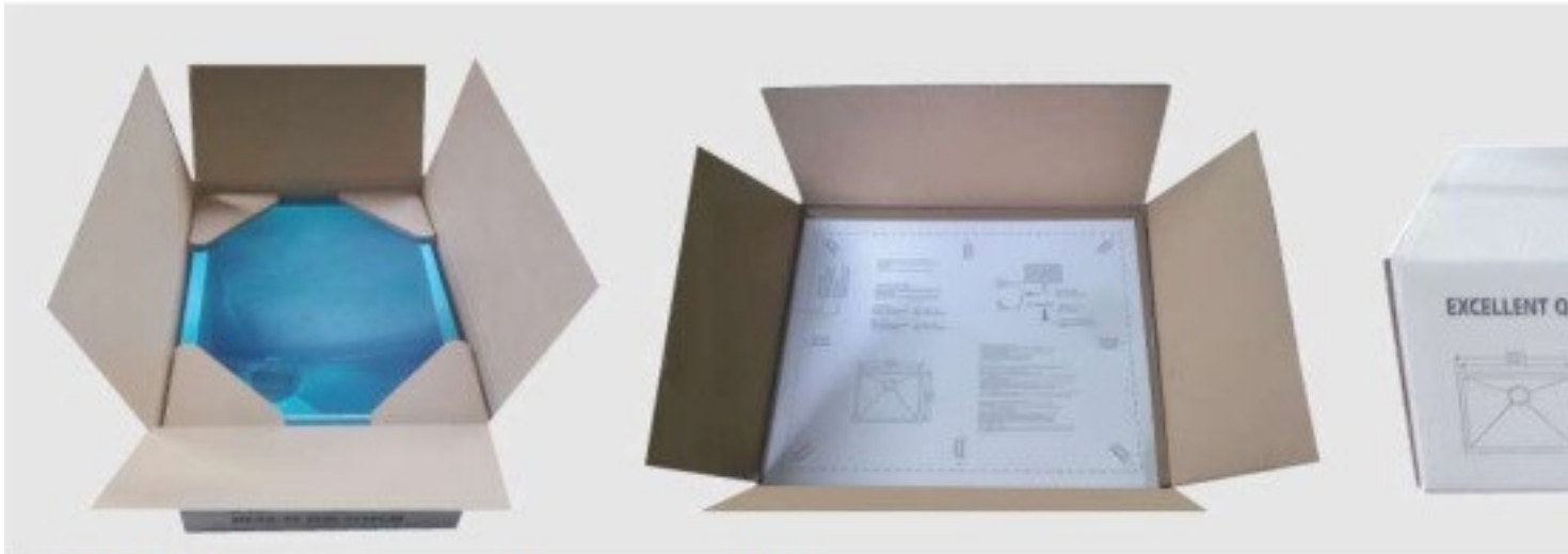
Thicker carton box packing